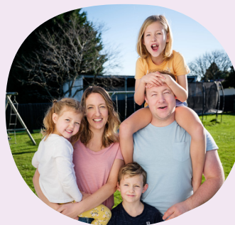
The Hillary family