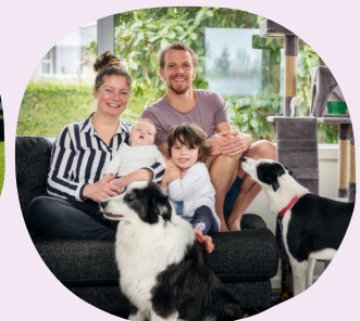
The Palmer family