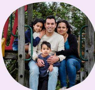
The Pinto family